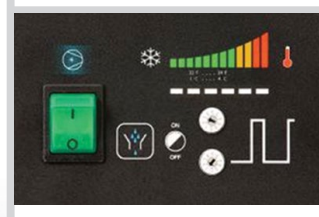
Controls: Models 200-400 scfm