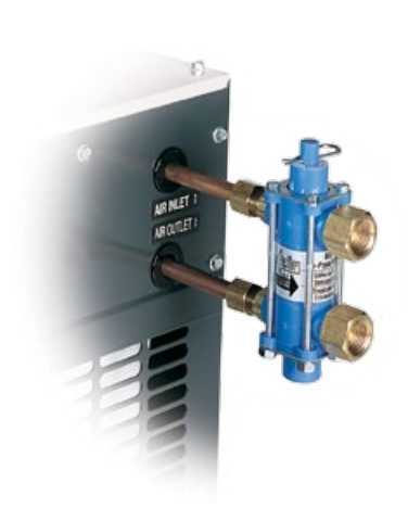
Air Bypass Valve