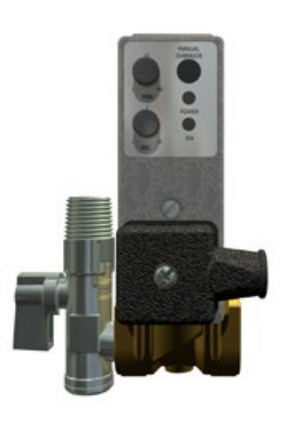
Adjustable Timed Electric Drain